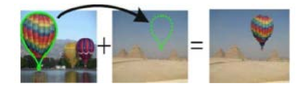
Figure 2: Image splicing

Image Splicing includes union of a minimum of two pictures to make a fake image. If the pictures with contrasting foundation are combined then it turns out to be very hard to make the borders and boundaries incoherent [6]. Image splicing is a process in which it crops and pastes regions from the same or different images. Digital photomontage uses image splicing so that two images can be sticked together using tools like Photoshop.